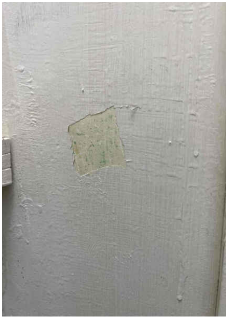
Lead Paint Sample Locations, 2nd Floor Hallway Closet