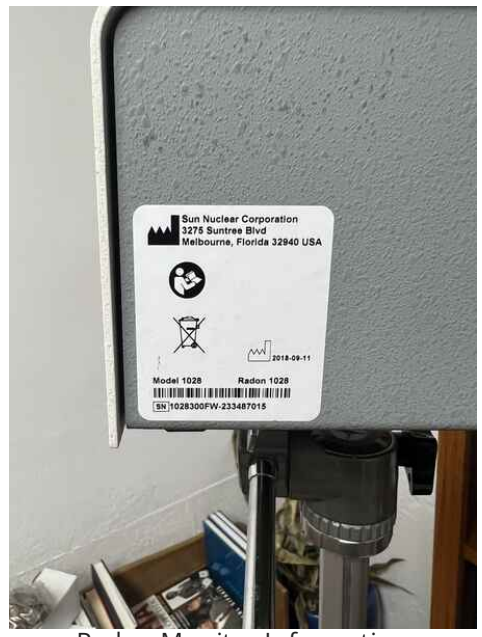
Radon Monitor Information