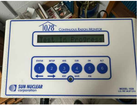
Radon Monitor Information